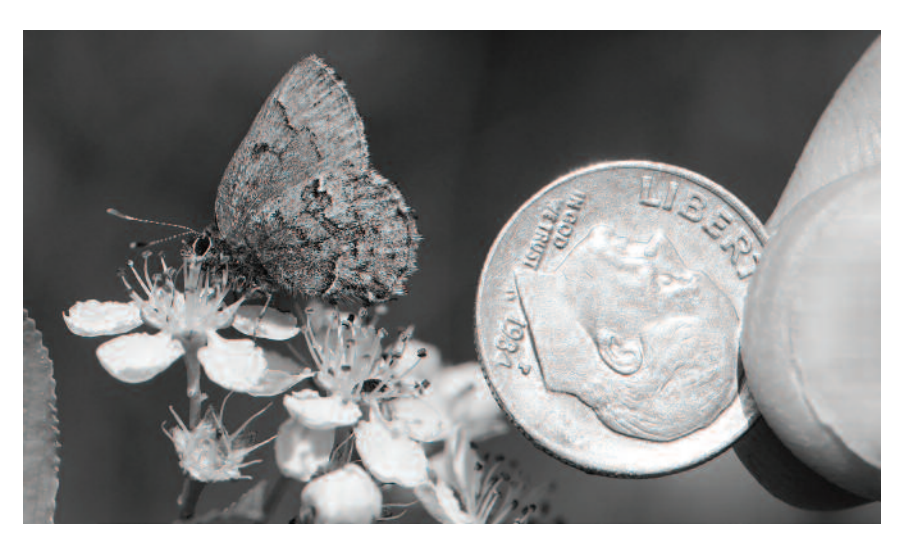
Bog Elfin ( Callophrys lanoraiiensis ), 5/27/13, Ashburnham, MA, Bruce deGraaf

Cover photo: Gray Hairstreak ( Strymon melinus ), Shrewsbury, MA, 8/13/13, Bruce deGraaf