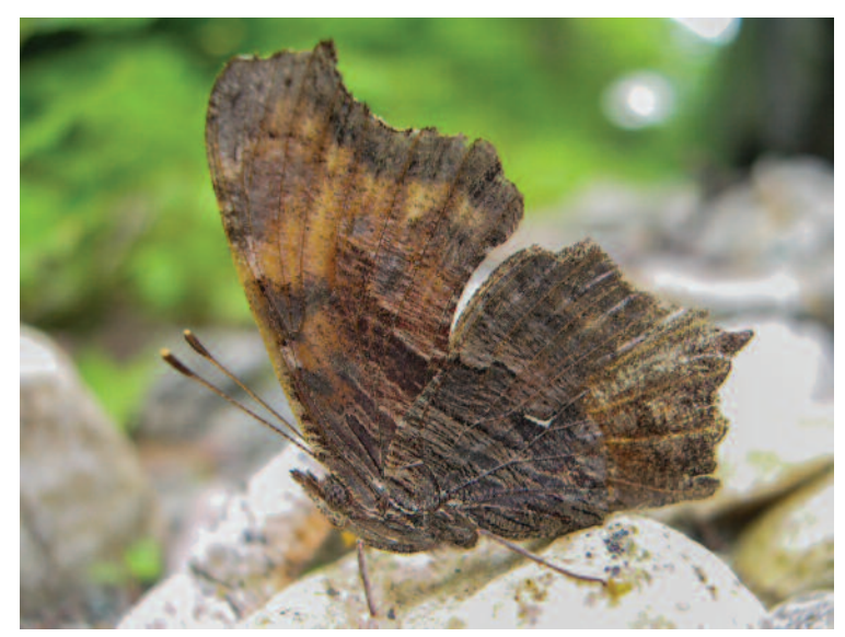
Gray Comma ( Polygonia progne), 7/11/04, Berkshire Co., MA