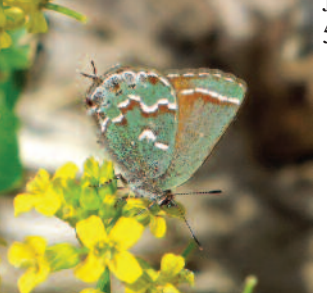
Juniper Hairstreak ( Callophrys gryneus ), 5/17/13, Holyoke, MA, Bill Benner