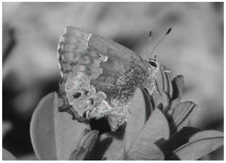
Frosted Elfin ovipositing on Wild Indigo, Lamson Road Site, 5/27/13, Madeline Champagne

I think that counting Frosted Elfins at this site is a different experience than recording other butterfly species numbers. There is a certain predictability about the Frosted Elfins. I have learned where I'll probably find the first one (the place has changed over the years). I may see a movement, or I may see that brown silhouette perched on the top of a plant. If perched on a plant, the butterfly will likely leave and then come back to the same area. I have always seen the males before I see the females. The males claim an area – trying to be in an optimum location for the females to find – and stay in that area with their perching behavior. Once I see a male in an area, the next time I go it is pretty predictable that the male (or a male) will be there. In the larger open areas, there are sometimes a few males, or in certain gravel pathways there are a few patrolling up and down. After twelve days or so from my first sighting I'll see the first females – a different flight behavior, as they are going to the host plants (here they use Wild Indigo, Baptisia tinctoria) for ovipositing.