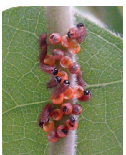
Pipevine Swallowtails ( Battus philenor ) hatching, 7/21/13, Paxton, MA, Elise Barry