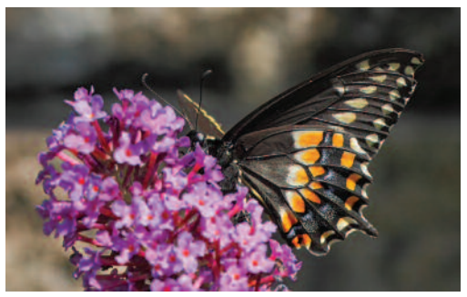
Black Swallowtail ( Papilio polyxenes ), aberrant form, 8/16/13, Shrewsbury, MA, Bruce deGraaf