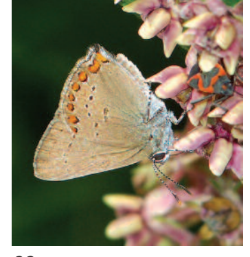
Coral Hairstreak ( Satyrium titus ), 7/14/13, Mt. Greylock, Adams, MA, Frank Model