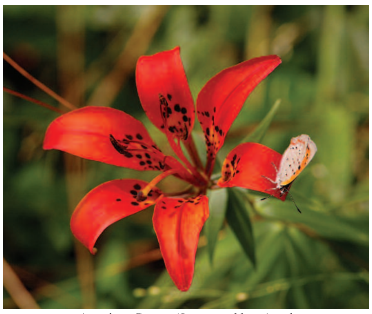
American Copper ( Lycaena phlaeas) and Wood Lily ( Lilium philadelphicum), 7/23/12, Mount Washington, MA