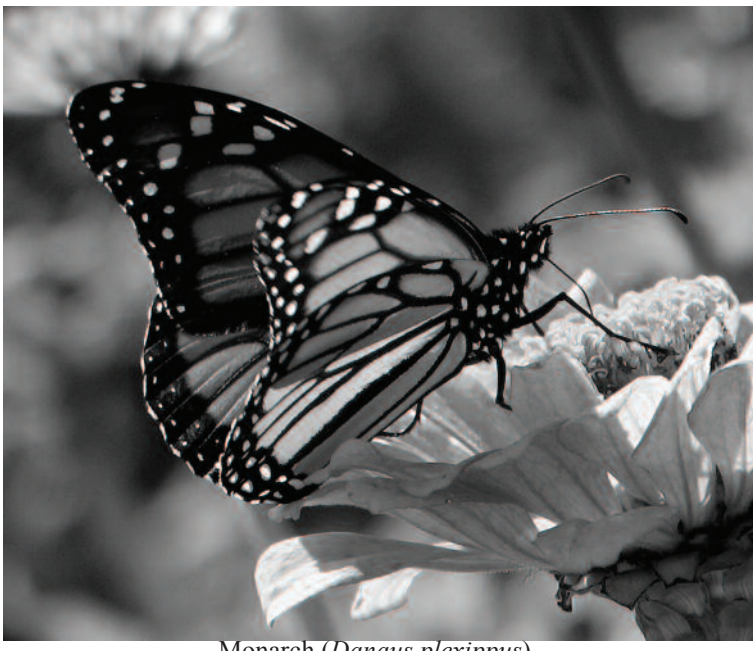
Monarch ( Danaus plexippus), Northampton, MA, 10/1/04

The Monarch Butterfly ( Danaus plexippus ) has a great sense of its wings. Seemingly carefree, the butterfly sails through layers of sky. It floats and glides in between fluttering like no other butterfly, and when back-lit by the sun the wings are as brilliant as stained glass. There is joy remembering times in the garden, walking behind tattered and faded female butterflies as they winged their way from one young milkweed to another, fastening hundreds of eggs on their host plants scattered throughout the gardens and fields. I remember observing one female monarch losing her balance, then sliding down a leaf abdomen first from fatigue after