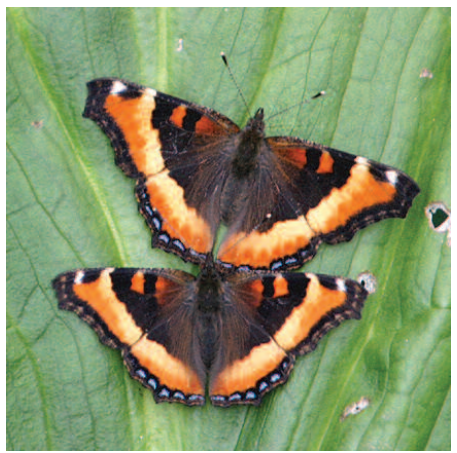
Milbert's Tortoiseshells ( Nymphalis milberti ), 6/23/03, Tom Murray (No reports of this species in Massachusetts for 2013)