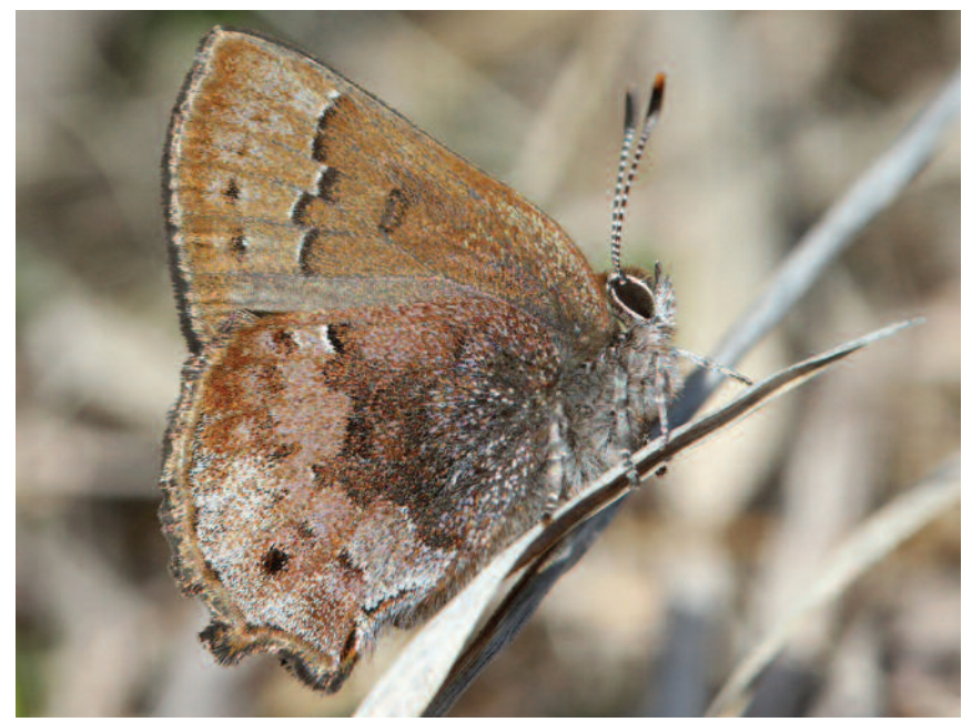
Frosted Elfin (Callophrys irus), 4/25/13, Chicopee, MA, Garry Kessler