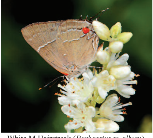
White M Hairstreak ( Parhassius m-album ), 8/11/13, Mattapoisett, MA, Bruce deGraaf