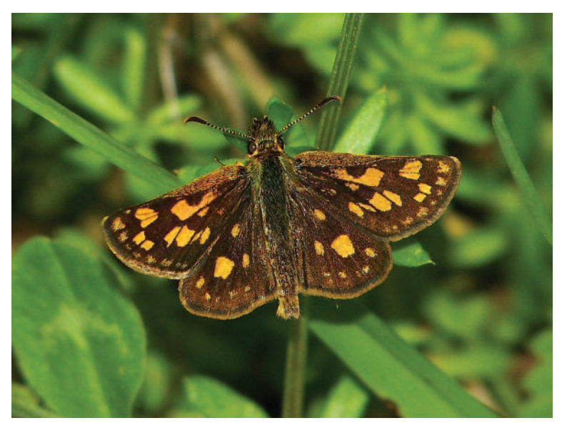
Arctic Skipper male, ( Carterocephalus palaemon ), Windsor, MA, 6/1/13, Frank Model