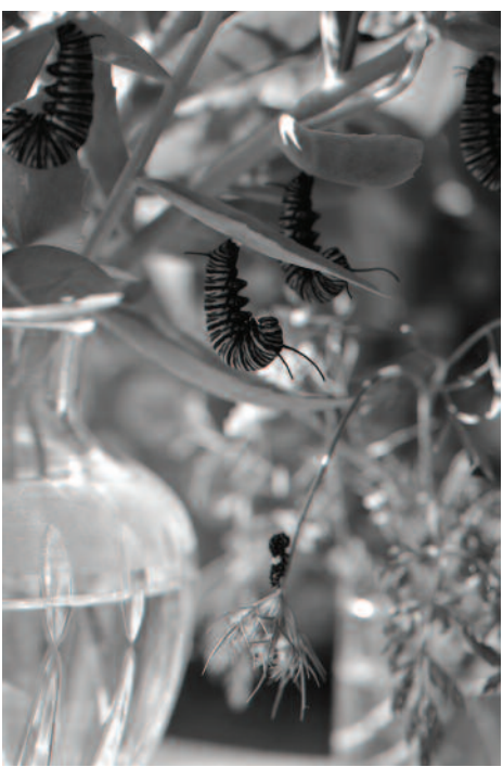
Monarch ( Danaus plexippus ) and Black Swallowtail ( Papilio polyxenes ) caterpillars, Williamsburg, MA, Carol Duke

The fifth instar spins its own destiny with silk threads brought forth from within itself. Measuring out each thread from its spinneret, its head turns from left to right like a silk-filled bobbin a weaver throws back and forth through a warp. After building the mat and securing threads of silk around leaves and sedum stalks to further anchor it, the caterpillar's true legs carefully shape a mound of silk like the hands of an adept sculptor working with clay. Hundreds