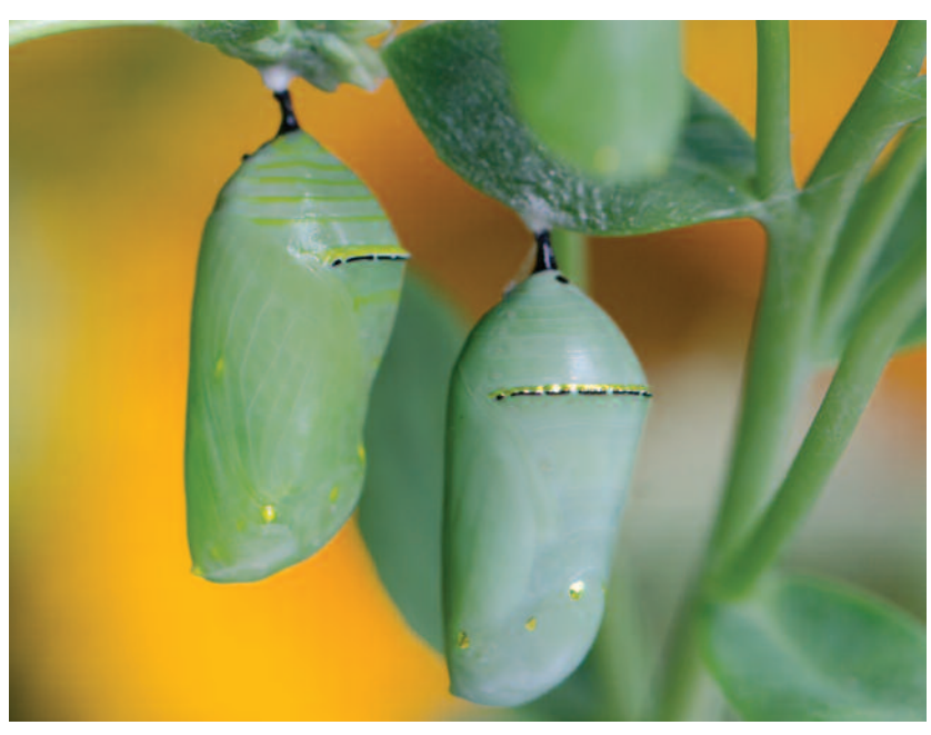
Monarch chrysalids ( Danaus plexippus), Williamsburg, MA